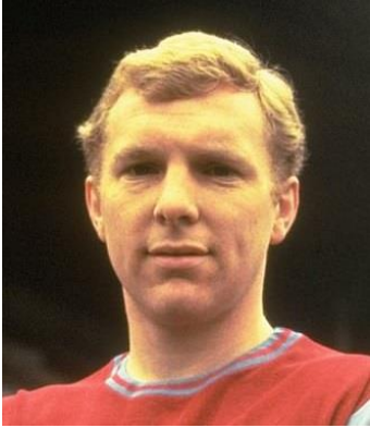
1. Bobby Moore Football

Famous sports personalities – How many can you name? Which sports are they famous for? One is done for you.