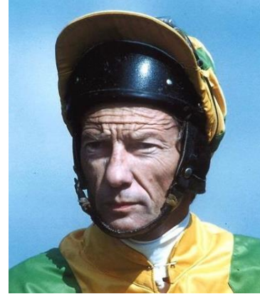
3. L P H R