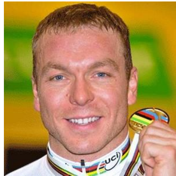
6. C H C