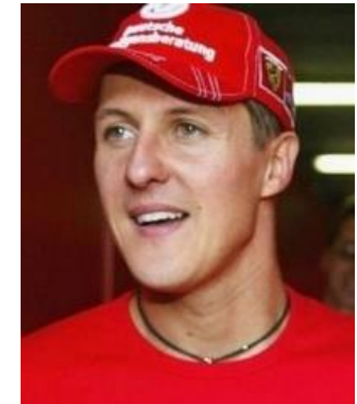
8. M S F 1(MR)