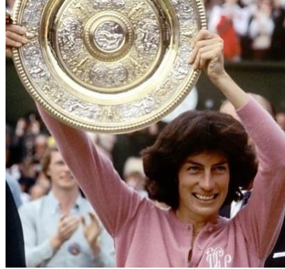
2. V W T