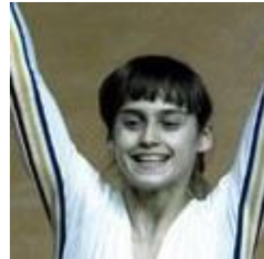
7. N C G