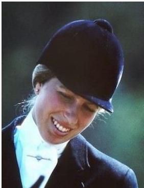
5. P A E (HR)