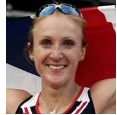
4. P R A